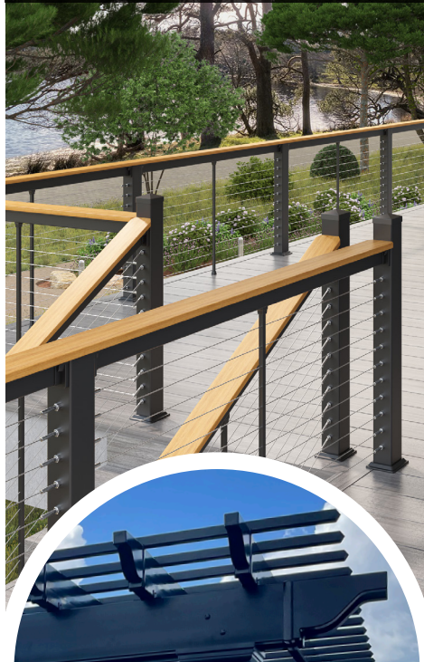
400 Series Railing