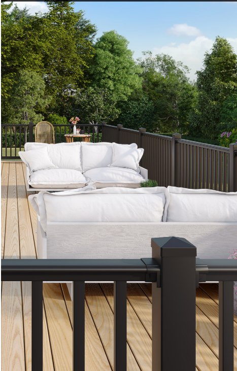
200 Series Railing